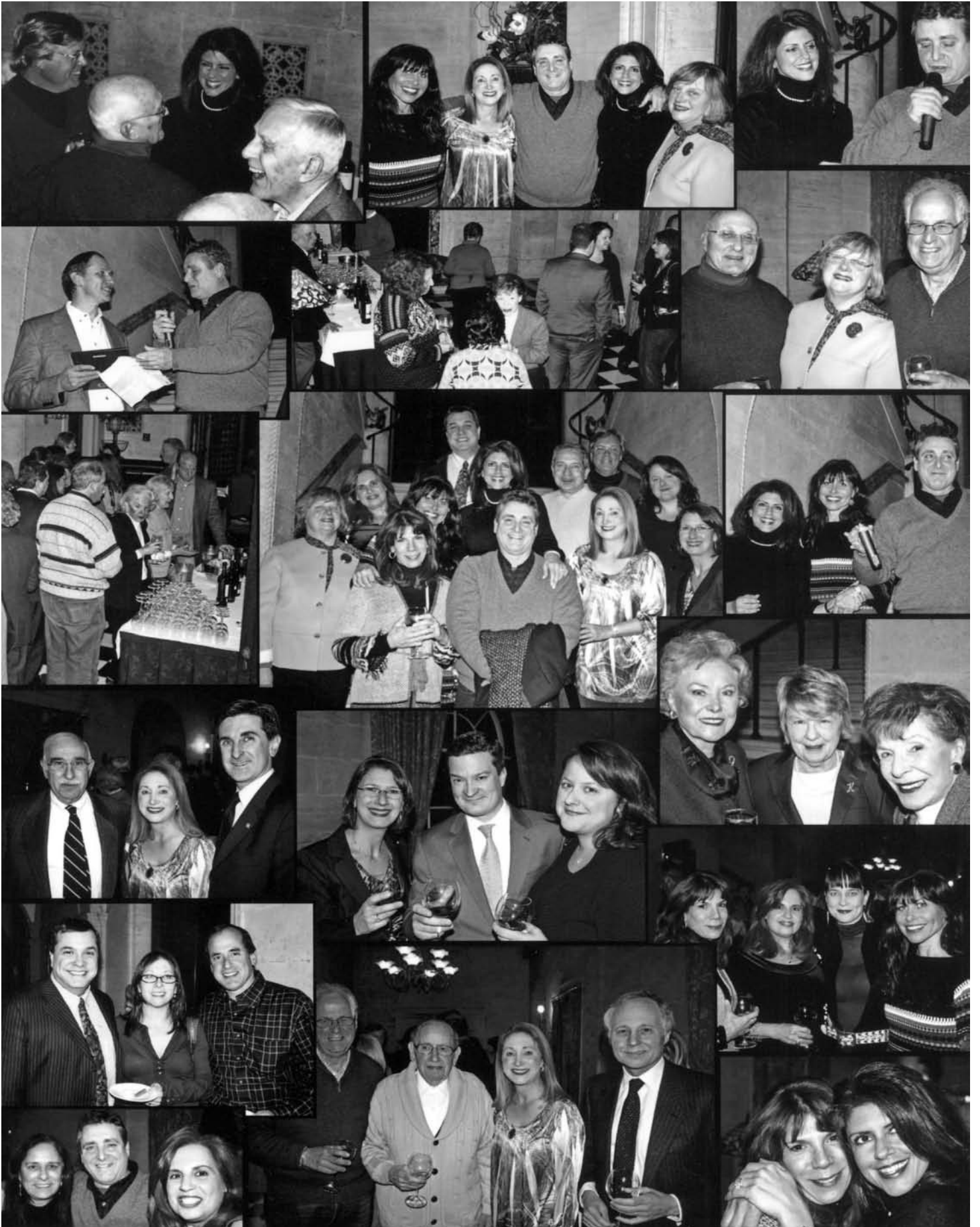
Year-end party at the Village Club